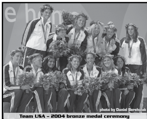
Team USA - 2004 bronze medal ceremony

Similar to 2008, the 2004 U.S. team won a tiebreaker against Russia to win its preliminary group and punch a ticket directly to the semifinals. The Americans dropped a 6-5 decision to Italy in a semifinal match before winning the bronze medal match.